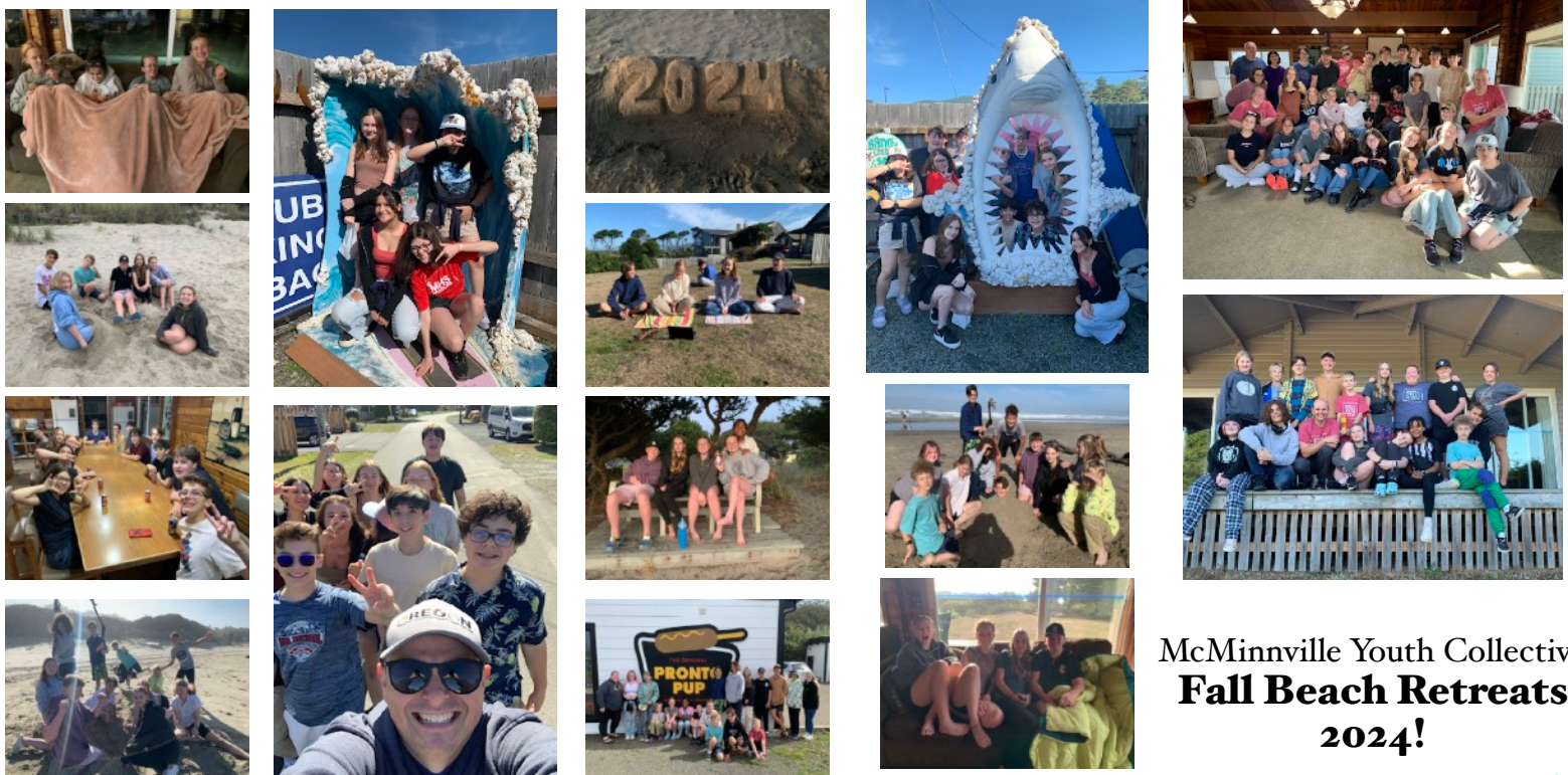
McMinnville Youth Collective Fall Beach Retreats 2024!