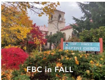
FBC in FALL