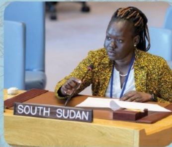
AMBASSADOR CECILIA ADENG South Sudan's Permanent Representative to the United Nations