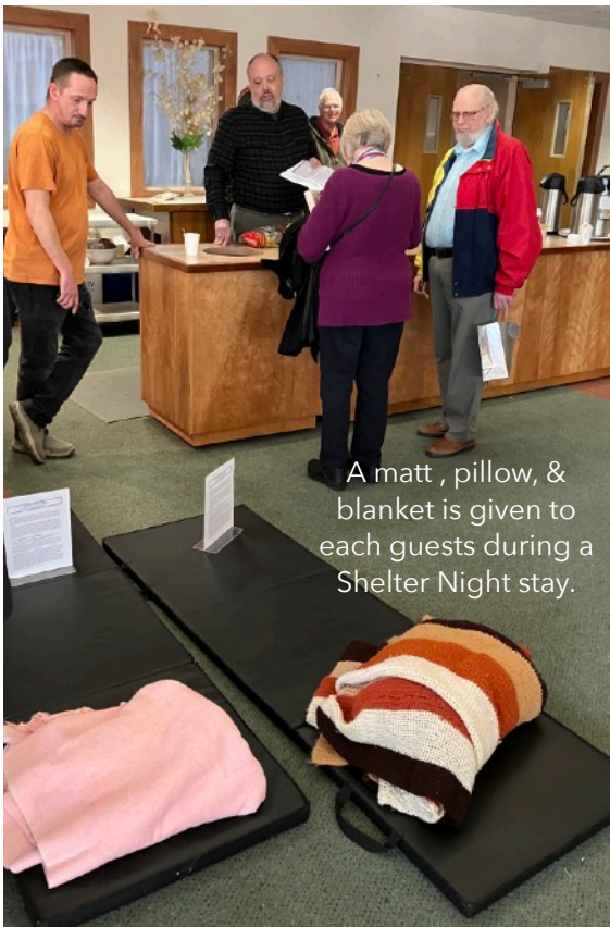
A matt, pillow, & blanket is given to each guests during a Shelter Night stay.

Now another season of big changes lies ahead. YCAP's big project on Adams Street nears completion. On Adams Street, YCAP's AnyDoor Place complex will offer: a whole building converted to provide low-barrier nighttime shelter seven nights a week ; AND a day center where houseless neighbors can gather safely, have basic comforts and snacks, charge devices, and so on; AND a "navigation center" where unhoused folk can receive wrap-around case management designed to address the many different facets of their needs. It's not a magic wand, but it will change the face of how we support our unhoused friends and neighbors.