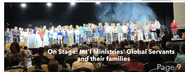
On Stage: Int'l Ministries' Global Servants and their families