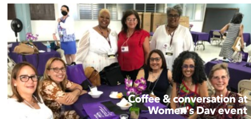
Coffee & conversation at Women's Day event